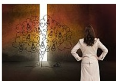
Where Does The US Rank in Innovation? Ideas Lab By GE