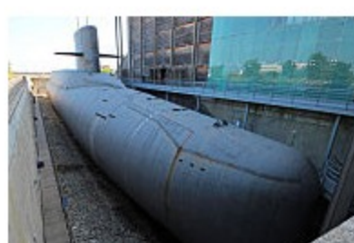
See Inside This Massive Submarine CNET