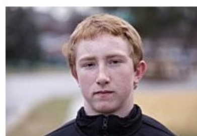
Meet the 14-Year-Old Who Can Lift More Than 300 Pounds The Atlantic