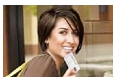
Why credit card interest makes no sense any longer given this... Next Advisor