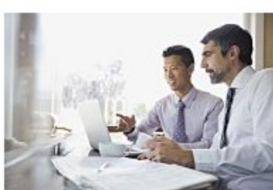
50 Apps You Need For Your Small Business SalesForce