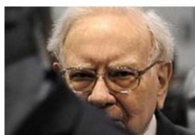
Buffett's Empire Is in Peril... And He Knows It The Motley Fool